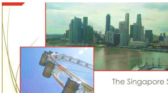
The Singapore Skyline

"In 2007 we moved to Singapore. The plan was to spend six months in a French-speaking country. Then we ended up in Singapore for eight years! When we got there we said we'd stay for two years, then it was another two, and another two and after eight years we said to ourselves, 'If we don't get away now 're going to be stuck here.'"